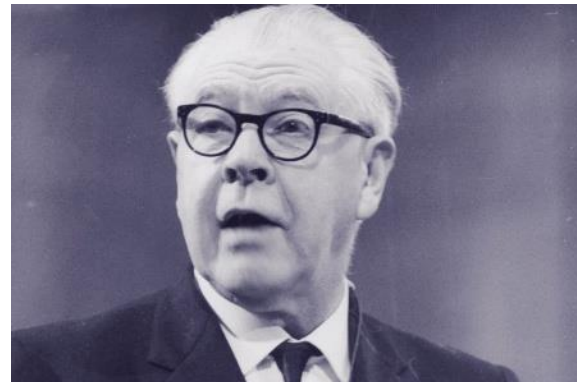
Robbins Report, 1963

"should be available to all who were qualified for them by ability and attainment"