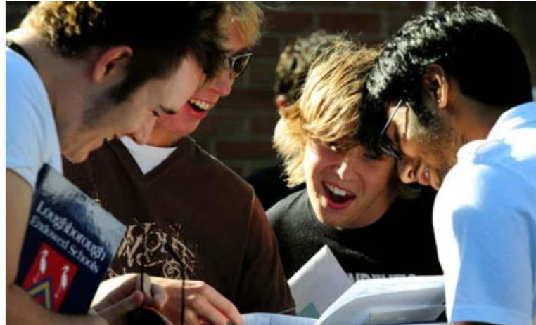
Students read their A-Level results at Loughborough Grammar School in Leicestershire.

Vice-chancellor attacks 'poorly timed' government closure of scheme as steep rise in tuition fees looms