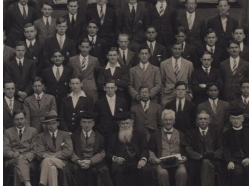
St John's College, Oxford (1925)